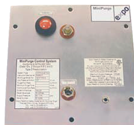
MiniPurge CF panel mount