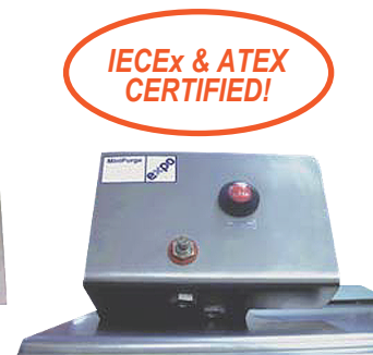
MiniPurge CF back plate